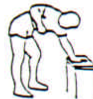
Bent Over Rows

Bent Over Rows: While bent over with back parallel to floor and arms hanging to floor, slowly pull arms up, bringing hands up to chest level. This motion is similar to using a cross-cut saw. Slowly lower arms to start and repeat as directed.