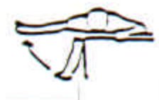
Prone Horizontal Abduction